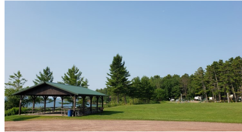
Memorial Park in Washburn

I need the sea because it teaches me. I don’t know if I learn music or awareness, if it’s a single wave or its vast existence, or only its harsh voice or its shining suggestion of fishes and ships. The fact is that until I fall asleep, in some magnetic way I move in the university of the waves.